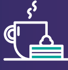
Snacks & drinks